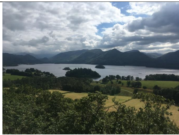
Keswick is very near to Derwent Water

If you've never been to the Keswick Convention, we would highly recommend a visit. There are activities for children and young