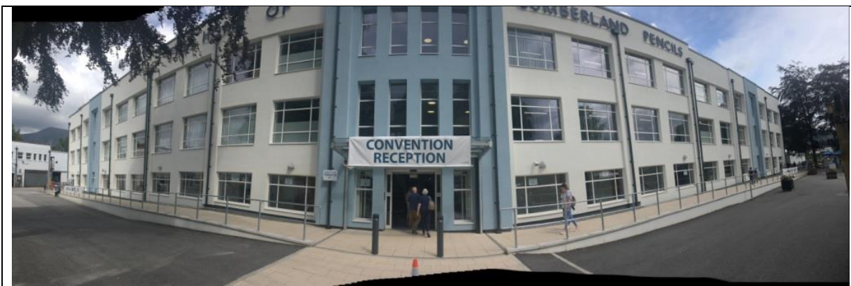
The recently renovated Pencil Factory (a panoramic view – it is straight!)

This was the first year that the Convention was almost all held on the site of the old Pencil Factory, which has been renovated to provide a number of large meeting rooms.