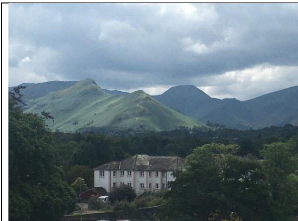
A view from the Pencil Factory roof

The Convention deliberately leaves the afternoons free, so you can go and discover the beauty of the Lake District.