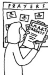
THE PRAYER BOARD