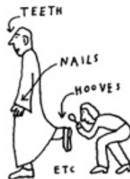
PRE- SERVICE CHECKS