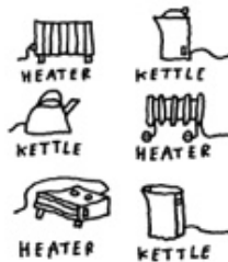
PORTABLE CHURCH APPLIANCE TESTING